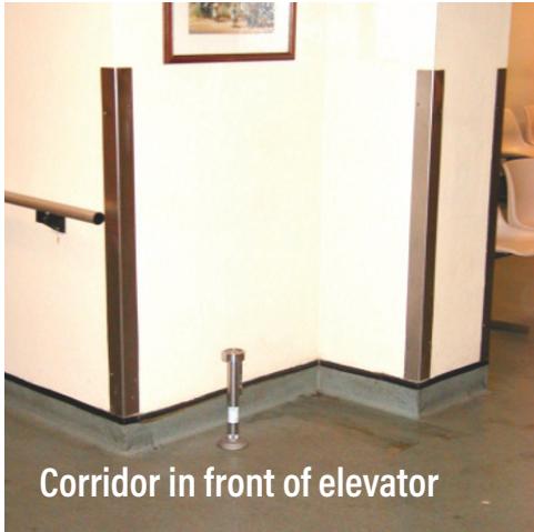
Corridor in front of elevator

The SAN-AIR gel relies on air contact time. There was a large amount of dust build up inside the ducts and outside the coils of the air conditioning unit and this dust acts as a carrier for the mould and microbial spores. By allowing the ingredients of SAN-AIR to evaporate and become mixed with the air stream the same way as dust and microbes do, the SAN-AIR vapours come into contact with the mould or microbes. Absorption of the vapours occur on the dust particles also, increasing the contact time and allowing SAN-AIR to inhibit growth of the organisms.